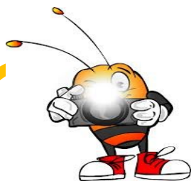
Photo retakes are scheduled for October 20th. School photos are used for the yearbook and student ID cards.