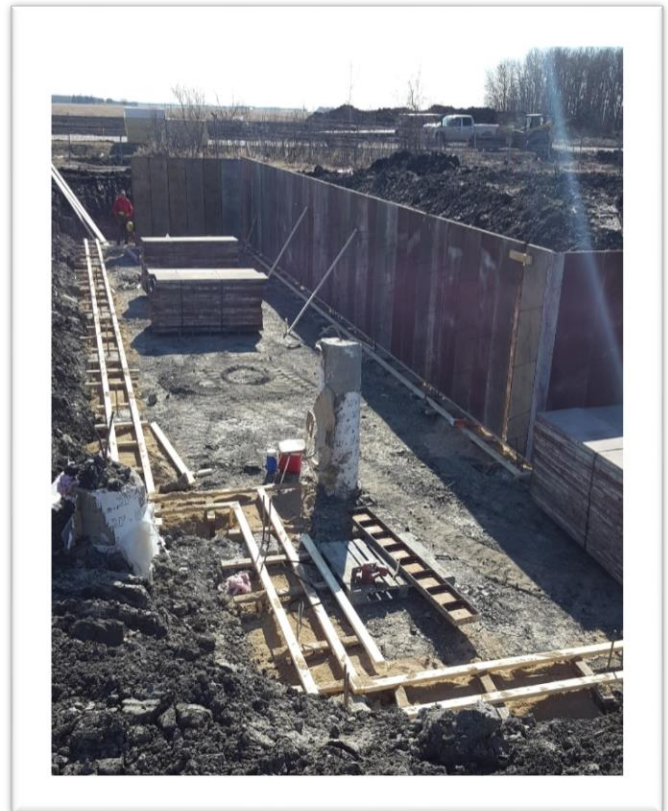
Framing for Utilidor utility tunnel to carry utility lines such as electricity, steam, water supply pipes, and sewer pipes.