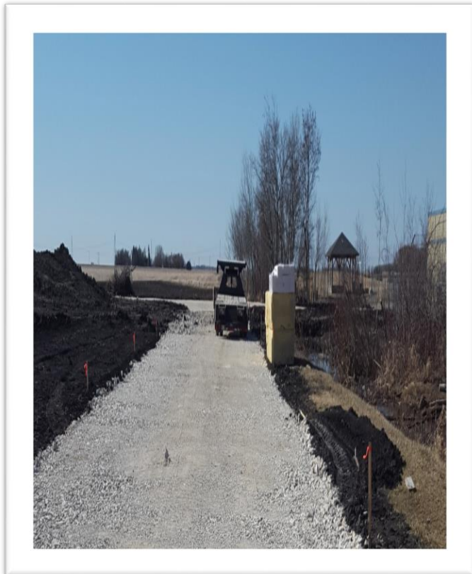
Newly installed fire lane