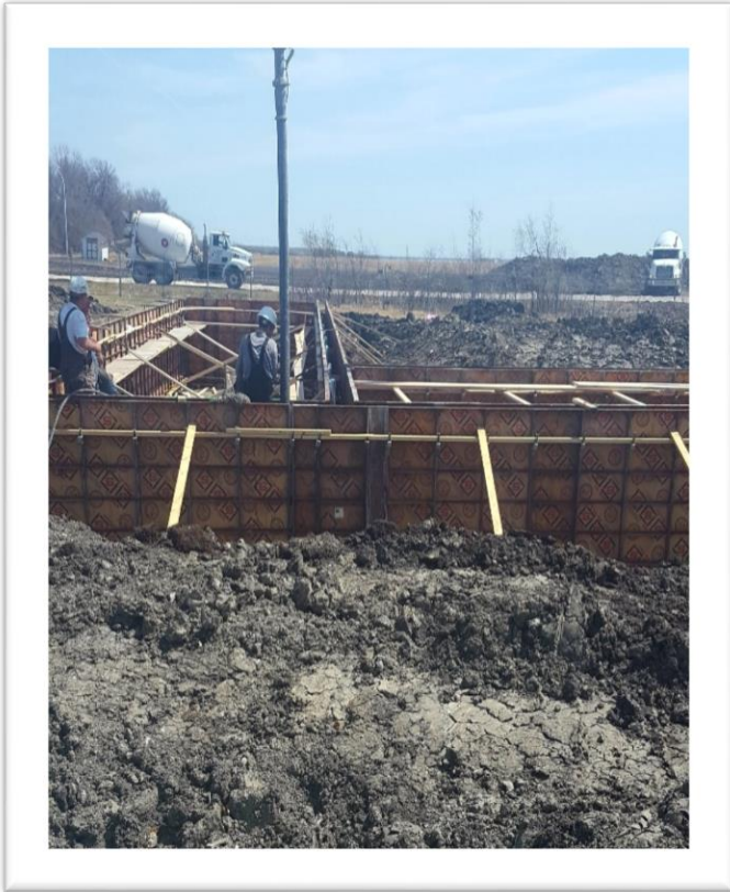
Preparing to pour concrete for Utilidor